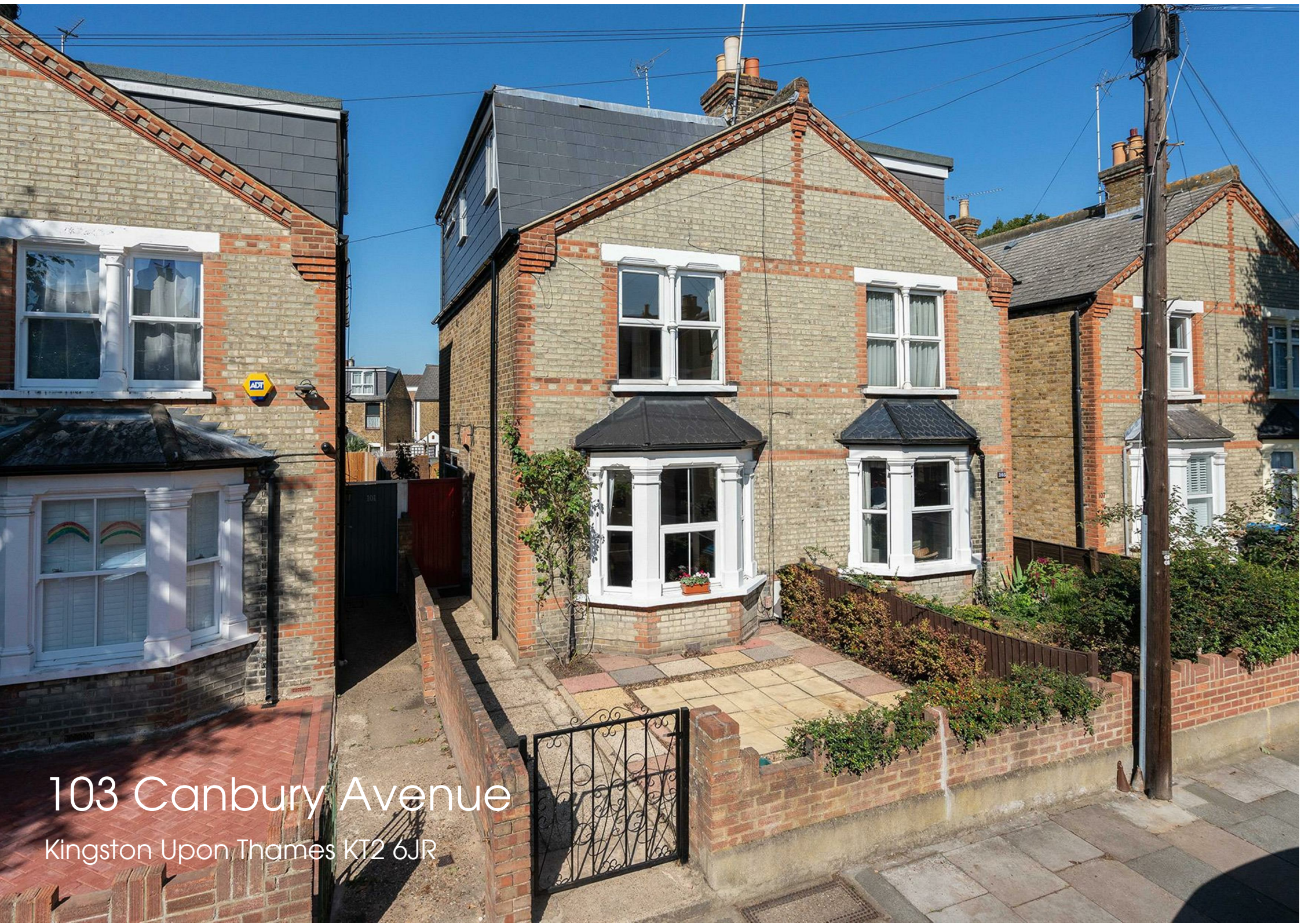
103 Canbury Avenue Kingston Upon Thames KT2 6JR

34 Richmond Road Kingston upon Thames Surrey KT2 5ED www.gibsonlane.co.uk Tel: 020 8546 5444